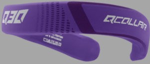
Q-Collar $12,00 for team