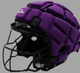
Guardian Cap $3,600