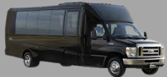
Team Travel $10,000/year