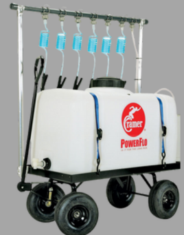
Portable Hydration Station $2,1000