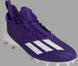
Team Cleats- $3,600