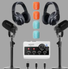
Video Broadcast Equipment 2 cameras and mics $1,000