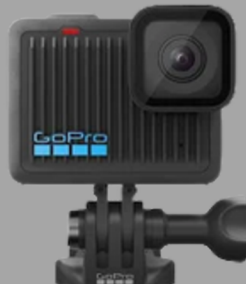
GoPro w/ extension stick $400