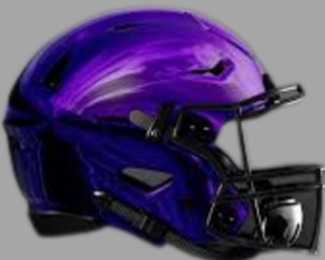
Game Day Skinz Helmet cover $3,600